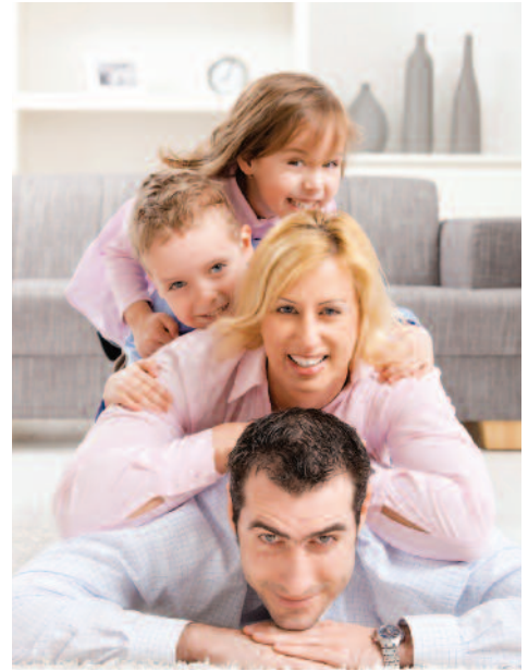
Insulation will bring you comfort and savings for the life of the home.

Adding insulation can offer you a lifetime of energy savings while improving the energy efficiency and comfort to your home.